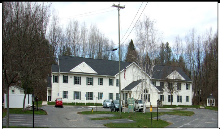
Upper Crown Landing Apartments April 2024