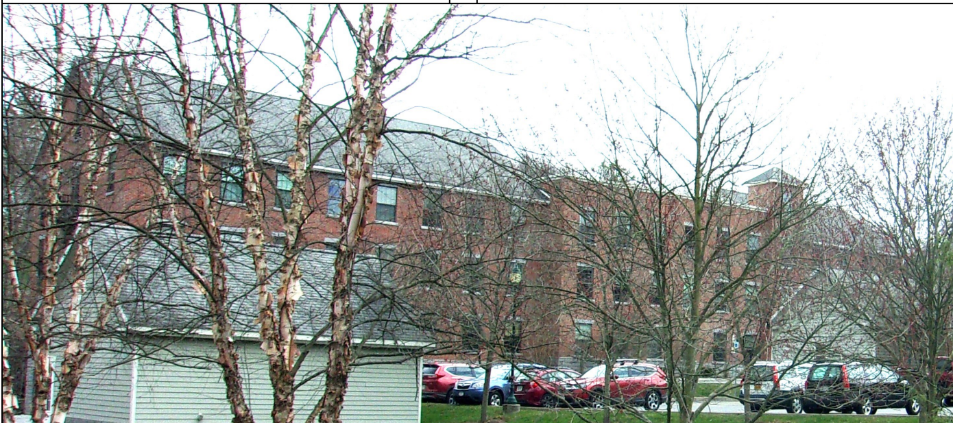
Marcellus Condominiums April 2024