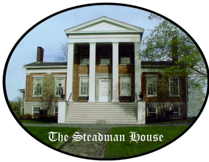
The Steadman House