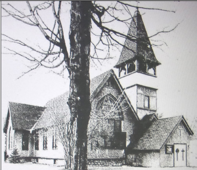
St. John's Episcopal Church