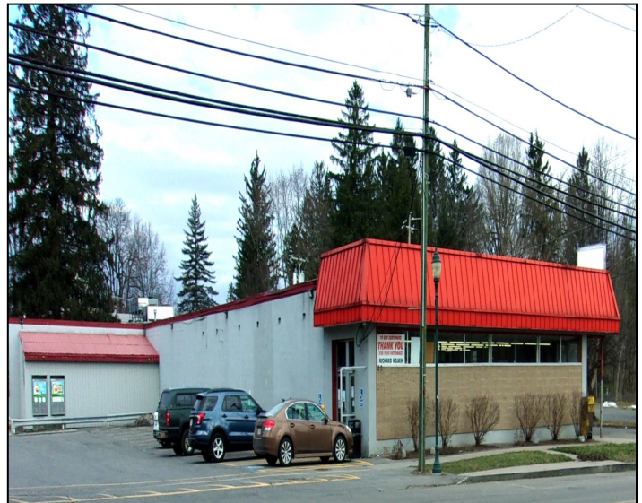
Nojaim's February 2024

The corner has a long history from the 1890's until now. That history continues.