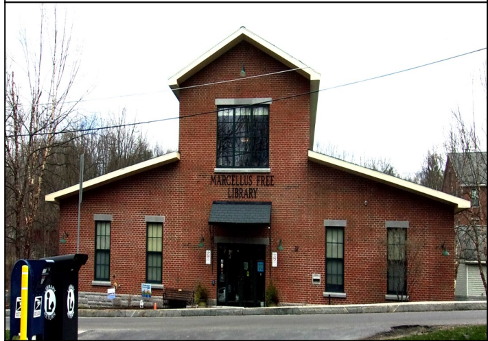
Marcellus Free Library April 2024