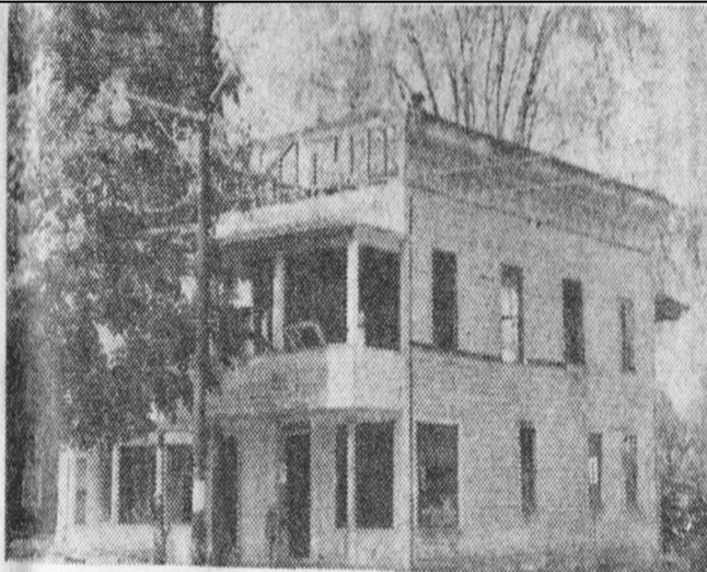
In the process of being dismantled, is shown the former Conley block which was purchased by Neil Fiske and is coming down to make way for a modern Supermarket.

December and started the under ground pipes for water, sewage and gas in January 1956. They started the foundation in February 1956.